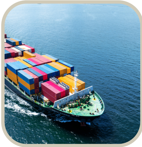
Supply Chain Disruptions