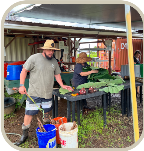
Disruption of farming practices and damaged agricultural lands