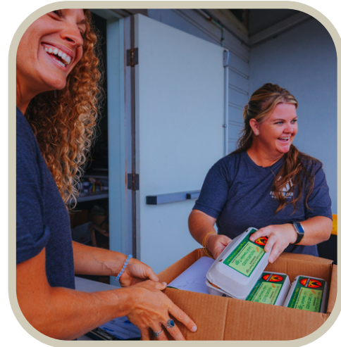
Community disruption in access to fresh, local produce